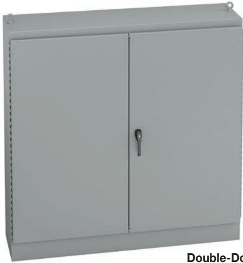
Double-Door Single-Access See page 118