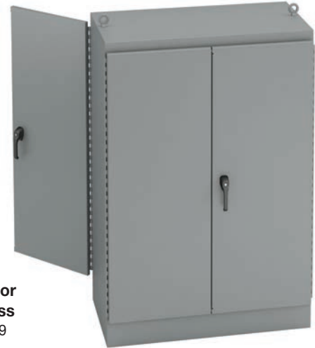
Double-Door Dual-Access See page 119